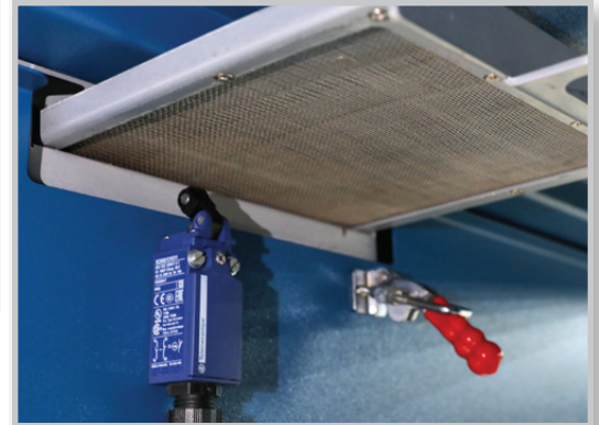
Easy-to-reach filters, belt replacement & lubrication points