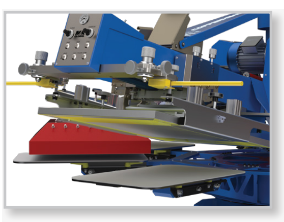
Individual mechanical head lifts assist operators for quick and easy screen cleaning